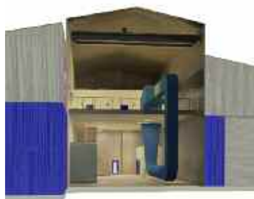
This image shows the placement of the Cavitation Tunnel in its new building at Blyth

The Emerson Cavitation Tunnel provides an efficient service to the marine sector, including ship owners, shipyards and propeller manufacturers. As well as commercial consultancy services, the Emerson Cavitation Tunnel offers background research and development services to academia for cavitation, noise, propulsion, turbines, coatings and hydrodynamics related activities.